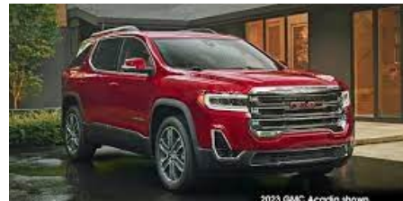
CHEVROLET TRAVERSE — GMC ACADIA

These available All Wheel Drive Sport Utilities have a maximum seating for 8 and up to 2,780L of cargo volume. Powered by a 310 HP 3.6L V6, the Traverse and Acadia are the perfect people mover.