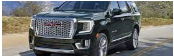
CHEVROLET TAHOE — CHEVROLET SUBURBAN — GMC YUKON — GMC YUKON XL

These available Four Wheel Drive Sport Utilities have a maximum seating for 9 and up to 4,097L of cargo volume. Powered by three engine choices, 5.3L V8, 6.2L V8 and 3.0L Duramax Diesel, GM's full size utilities are ready to tackle your next trip.