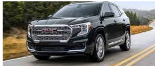
CHEVROLET EQUINOX — GMC TERRAIN

These available All Wheel Drive Sport Utilities have a maximum seating for 5 and up to 1,800L of cargo volume. Powered by a 175 HP 1.5L Turbo engine, providing smooth acceleration and great fuel economy.