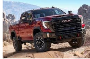
CHEVROLET SILVERADO HD — GM SIERRA HD

The all new Silverado and Sierra Heavy Duty's have arrived sporting features such as a new gas 6.6L engine boasting 401 HP and 464 lb-ft of torque. The proven 6.6L Duramax Diesel now pumps 445 HP and 910 lb-ft of torque and with its new frame structure and 10 speed Allison transmission, has a gooseneck max tow capacity of 36,000 lbs! The box of this truck will help you get the job done with corner steps in the rear bumper, box side steps, 12 cargo tie downs, LED box lights, bed mounted 120V power outlet and the Sierra Multi Pro Tailgate.