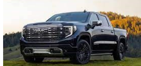
CHEVROLET SILVERADO 1500 — GMC SIERRA 1500

Our legendary 1500's keep getting better with our next generation trucks featuring advanced tech such as an available 3.0L Duramax Diesel and Sierra's Multi Pro Tailgate. Three cab styles, two box lengths, eight trim levels and five engine choices make the Silverado and Sierra customizable to your business. The Factory lift kit makes these trucks perfect for Northern Alberta.