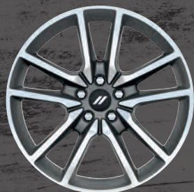
20x8-inch Tinted Clear Polish with Granite Pockets Included with Plus Package on R/T