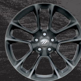
20x9-inch Low-Gloss Granite Crystal Standard on Scat Pack 392 Included with Daytona Package on R/T