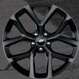
20x8-inch Black Noise Included with Blacktop Package on SXT RWD, GT RWD and R/T