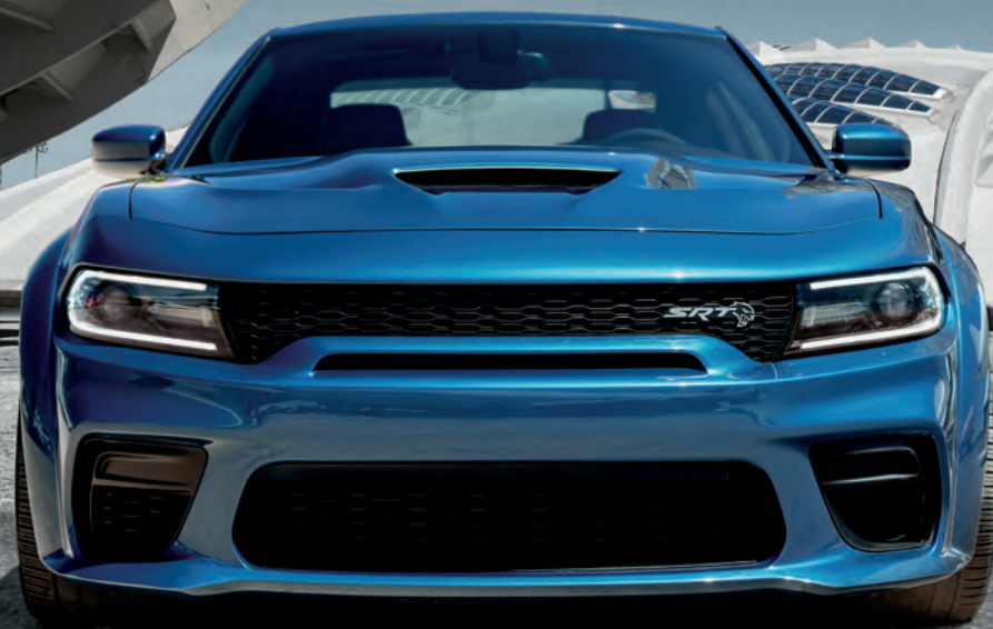
SRT Hellcat® Widebody shown in Frostbite

QUICKEST SEDAN EVER 3 1/4 MILE: 10.96 SECONDS