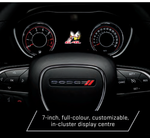
7-inch, full-colour, customizable, in-cluster display centre

The feeling is nostalgia. The performance is modern-day technology. The bragging rights are yours. Charger Scat Pack 392 and new Scat Pack 392 Widebody are fed by the 485-horsepower, 475 lb-ft of torque 392 HEMI® V8 engine. Scat Pack models feature big Brembo® brakes, 3-Mode Electronic Stability Control (ESC) 4 with Full-Off Mode, high-performance suspension with Bilstein® shocks and 20x9-inch aluminum wheels, and available cold-air induction to help you use that power responsibly.