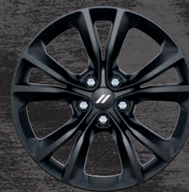
19x7.5-inch Black Noise Included with Blacktop Package on SXT AWD and GT AWD