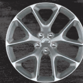
20x8-inch Satin Carbon Standard on GT RWD Included with Plus Package on SXT RWD