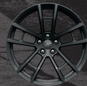
20x9.5-inch Low-Gloss Black Forged Included with Daytona Package on Scat Pack 392