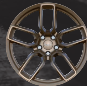
20x11-inch Brass Monkey Widebody Forged Optional on SRT Hellcat Widebody