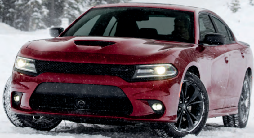
Charger GT AWD shown in Octane Red