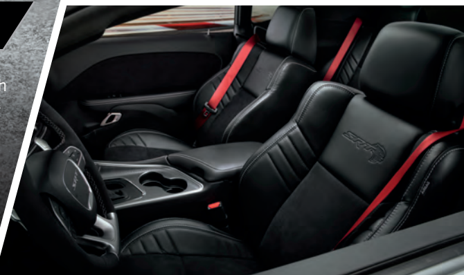
SRT® interior shown with Laguna leather seats and perforated inserts in Black

Charger SRT Hellcat Widebody includes the SRT® tuned Bilstein Three-Mode Adaptive Damping Suspension system that provides driver-selectable settings to include: Street [Auto] Mode = sporty but compliant ride; Sport Mode = firm, maximum handling; Track Mode = firm, maximum handling plus performance shifting and a gear-holding feature to suit any driver's needs. The SRT Drive Modes, which are accessed via the 8.4-inch Uconnect® touchscreen, offer selectable settings for Street [Auto], Sport and Track. There is also a custom setting that allows drivers the ability to tailor their experience by individually adjusting horsepower, transmission shift speeds, steering effort, paddle shifters, traction and suspension preferences. The standard SRT Performance Pages bring critical vehicle performance data to the driver's fingertips, while race options give the driver the ability to access Launch Control, Shift Light and Line Lock.