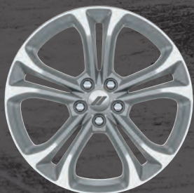
20x8-inch Satin Carbon Standard on R/T Included with Plus Package on GT RWD