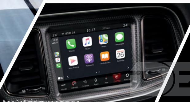
Apple CarPlay® shown on touchscreen.