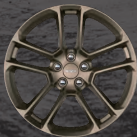
20x9.5-inch Brass Monkey Lightweight Forged Optional on Scat Pack 392