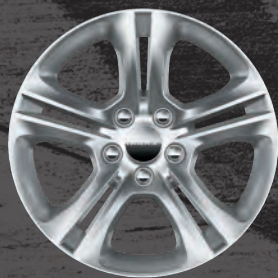
17-inch Fine Silver aluminum Standard on SXT RWD