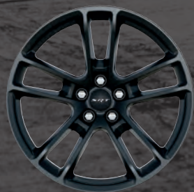
20x11-inch Carbon Black Standard on SRT Hellcat® Widebody Optional on Scat Pack 392 Widebody