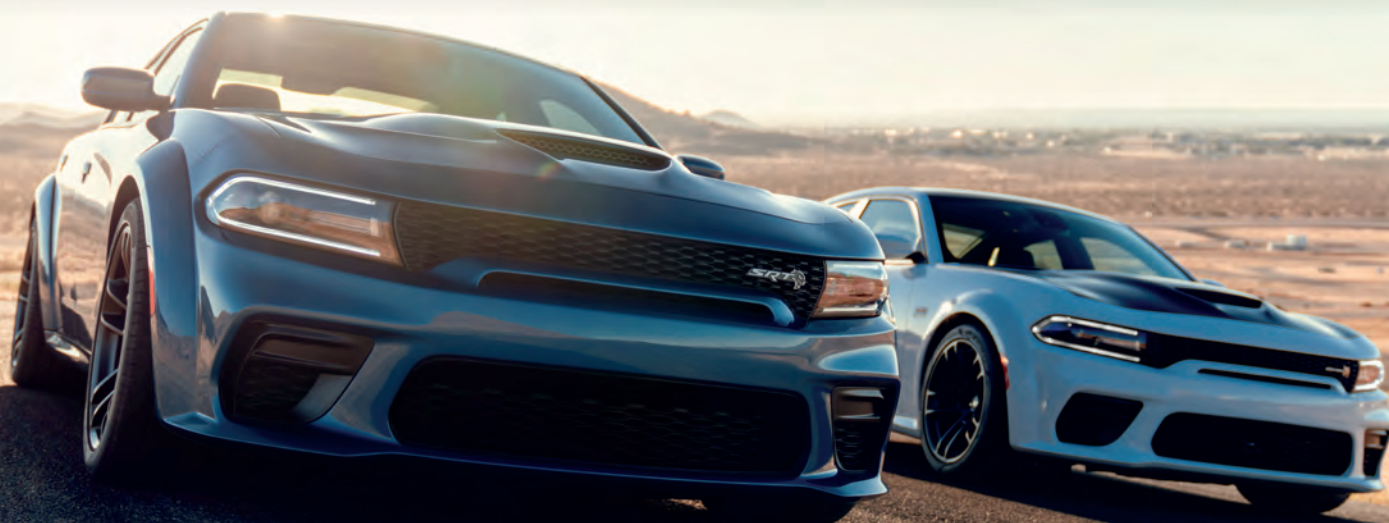
SRT Hellcat® Widebody (left) in Frostbite Scat Pack 392 (right) in White Knuckle