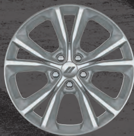
19x7.5-inch Satin Carbon Standard on SXT AWD and GT AWD