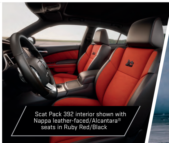
Scat Pack 392 interior shown with Nappa leather-faced/Alcantara® seats in Ruby Red/Black

The interior boasts standard race-inspired seats complete with embroidered Bee logo (standard high-performance premium cloth or available Nappa leather-faced with Alcantara® suede inserts). Every Scat Pack 392 model includes Dodge SRT® Performance Pages that feature everything from Launch Control to a g-force meter to drag-race timers. This real-time data can also be accessed on either the standard 7-inch, full-colour, customizable, in-cluster display centre housed between the gauges or the standard 8.4-inch Uconnect® touchscreen. SRT Drive Modes offer the ability to customize steering feel, transmission shift points, throttle response, ESC 4 tuning and suspension firmness (if equipped with Adaptive Damping Suspension).