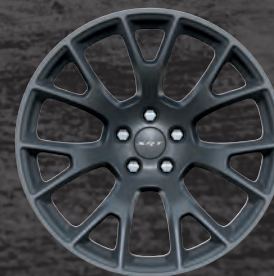
20x11-inch Warp-Speed Granite Optional on SRT Hellcat Widebody