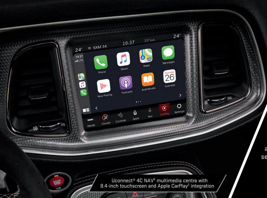
Uconnect® 4C NAV³ multimedia centre with 8.4-inch touchscreen and Apple CarPlay² integration