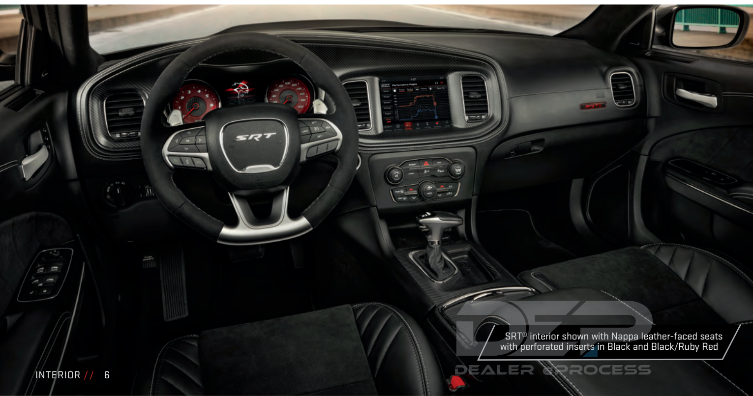
SRT® interior shown with Nappa leather-faced seats with perforated inserts in Black and Black/Ruby Red

Spacious and comfortable, Charger offers more than enough space for five adults. Seat options range from premium cloth to Nappa leather-faced with Alcantara® suede inserts to premium Laguna full-leather. Standard cabin details include integrated storage, soft-touch surfaces and available Dual-Zone Automatic Temperature Control (ATC). Heated/ventilated front seats, heated rear seats and a full-circumference heated steering wheel for year-round comfort are also available.