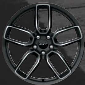
20x11-inch Devil's Rim Forged Standard on Scat Pack 392 Widebody