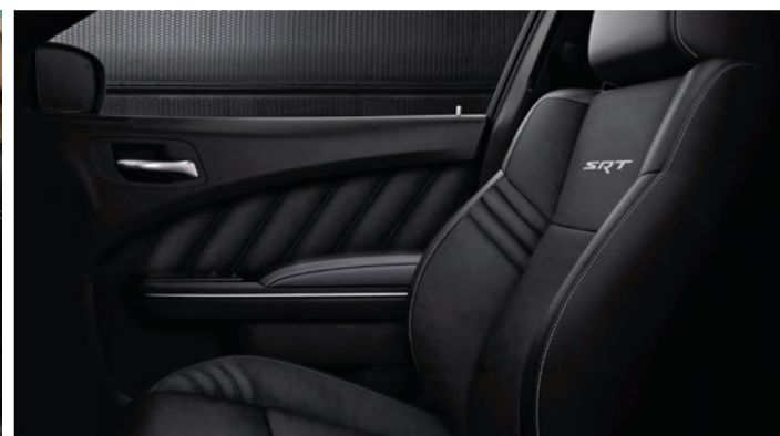
SRT Hellcat® Widebody interior shown with premium Laguna full-leather seats in Black