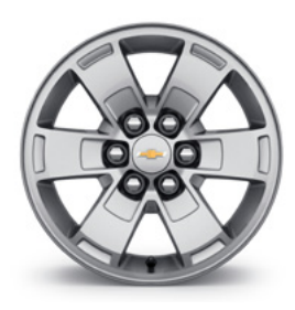
16" Ultra Silver Metallic-painted aluminum (RS1) (Available on WT)<sup>5</sup>