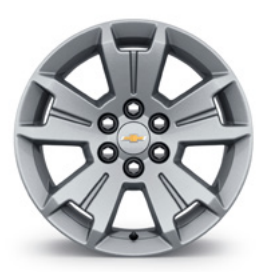
17" Blade Silver Metallic-painted aluminum (Q5U) (Standard on LT)