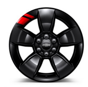
18" Black-painted aluminum with Red accents (RSZ) (Available on LT)<sup>7</sup>