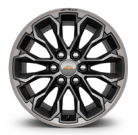
17" aluminum (R34) (Standard on ZR2)