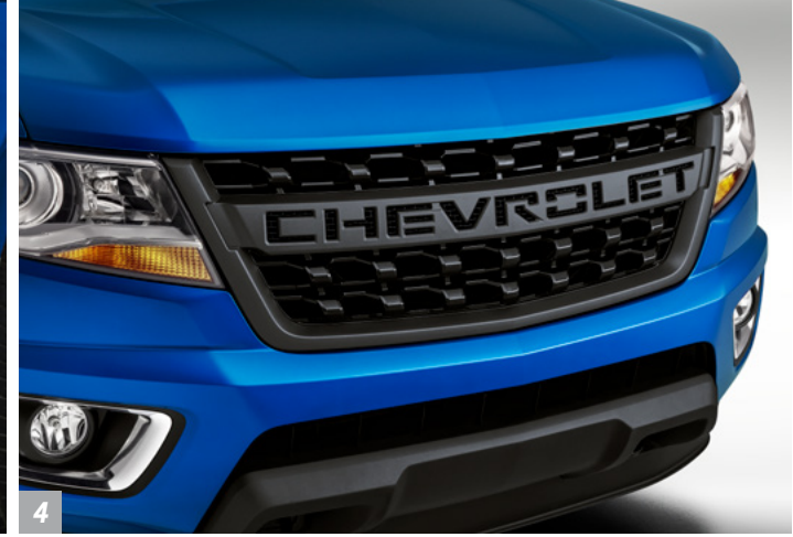
\underline{1} \ Equipment \ from \ independent \ suppliers: See \ An \ Important \ Note \ About \ Alterations \ And \ Warranties \ on \ the \ Complete \ Care \ page \ later \ in \ this \ brochure.

Chevrolet Accessories are dealer-installed and covered by the 3-year/60,000 kilometre (whichever comes first) Base Warranty Coverage of the New Vehicle Limited Warranty when ordered with your new Colorado. Conditions apply. See Warranty Booklet for details. Some vehicles are shown with equipment from an independent supplier. GM licensed and Associated Accessories are covered under the accessory-specific manufacturer's warranty and are not warranted by GM or its dealers. GM is not responsible for the safety or quality of independent supplier alterations.