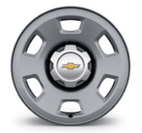
16" Ultra Silver Metallic-painted steel (RS2) (Standard on Base and WT)