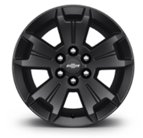
17" Gloss Black-painted aluminum (RIF) (Available on Z718 and ZR29)