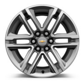
18" Dark Argent Metallic-painted aluminum (RCV) (Available on WT<sup>6</sup> and LT)