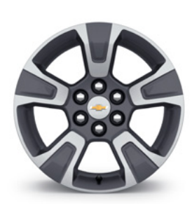
17" Dark Argent Metallic-painted aluminum (R28) (Standard on Z71)