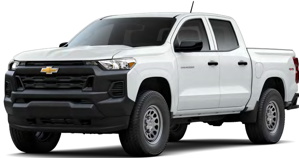
2025 U.S. model shown with optional equipment.