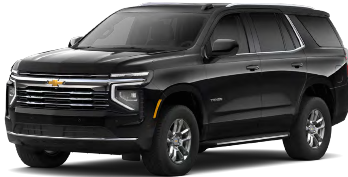
2025 U.S. model shown with optional equipment.