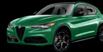
Verde Fangio Metallic