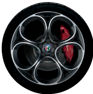
20-inch Sport 5-Hole Aluminum Wheel Standard