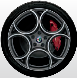
19-inch Sport 5-Hole Aluminum Wheel Available