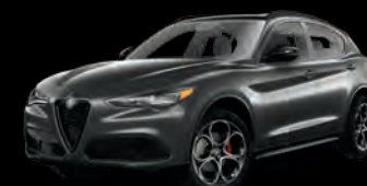
Vesuvio Grey Metallic