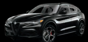
Vulcano Black Metallic