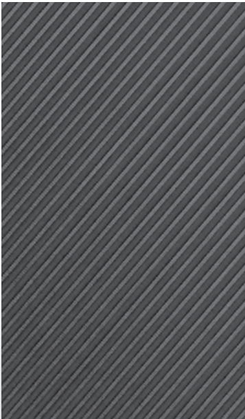
Aluminum Interior Trim Standard