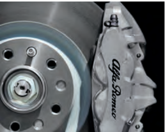
Silver-Painted Brake Calipers with Black Script Standard