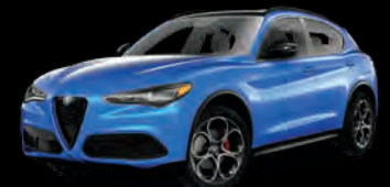
Misano Blue Metallic