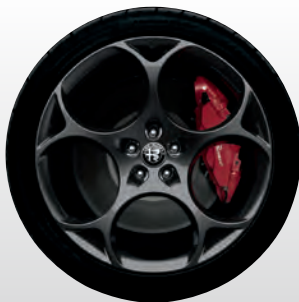
21-inch Dark 5-Hole Aluminum Wheel Available