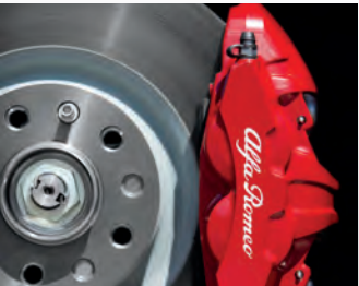
Red-Painted Brake Calipers with White Script Available