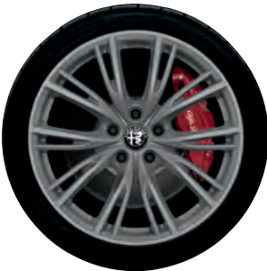
18-inch Multi-Spoke Aluminum Wheel Standard