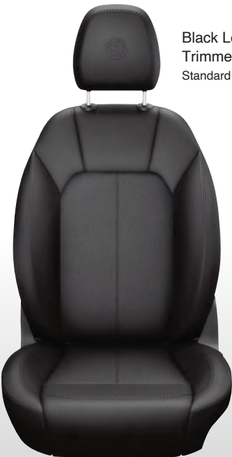
Black Leather-Trimmed Seat Standard