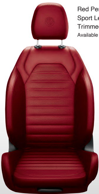
Red Performance Sport Leather- Trimmed Seat Available