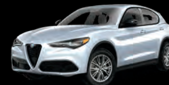
Moonlight Grey Metallic